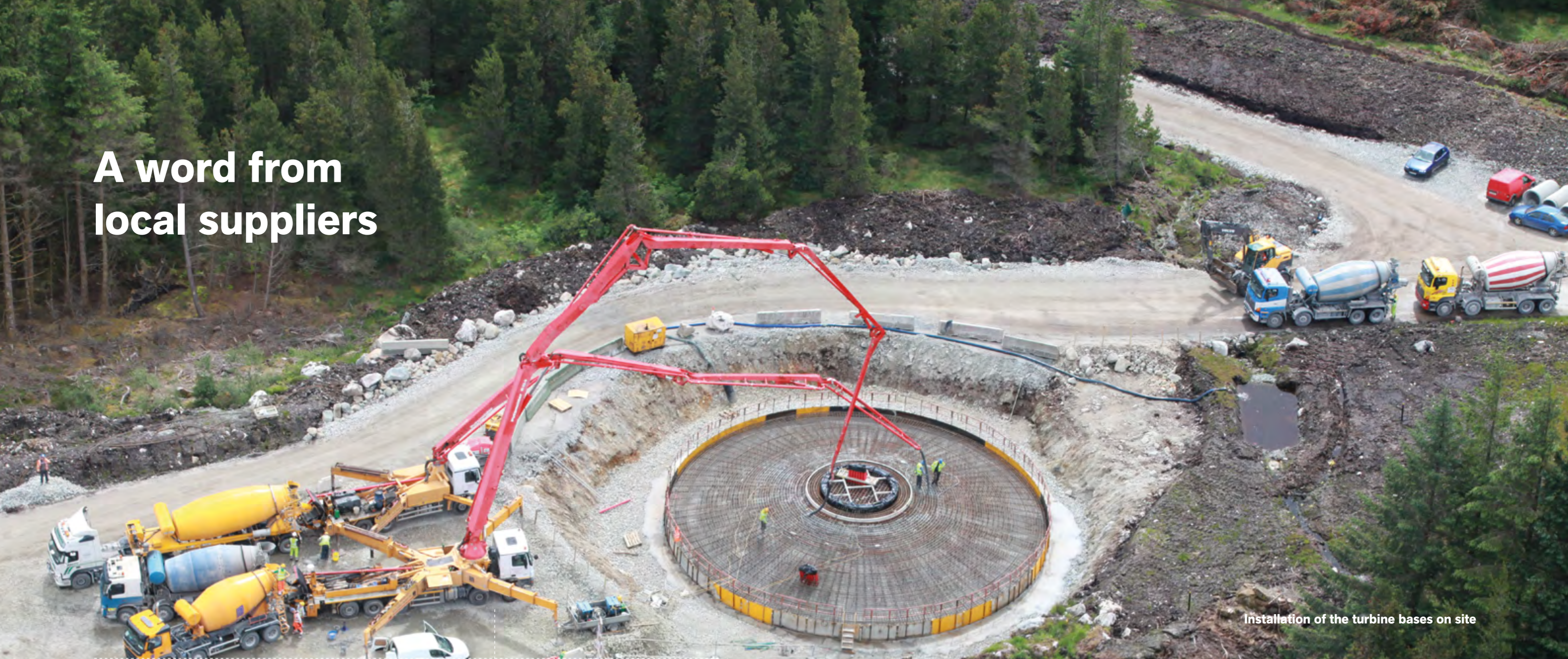
Installation of the turbine bases on site

"I have been involved since the Galway Wind Park project first started. As a local businessman, I am grateful for the opportunity to work on such a big project in the area. My company provides heavy plant equipment for the project.