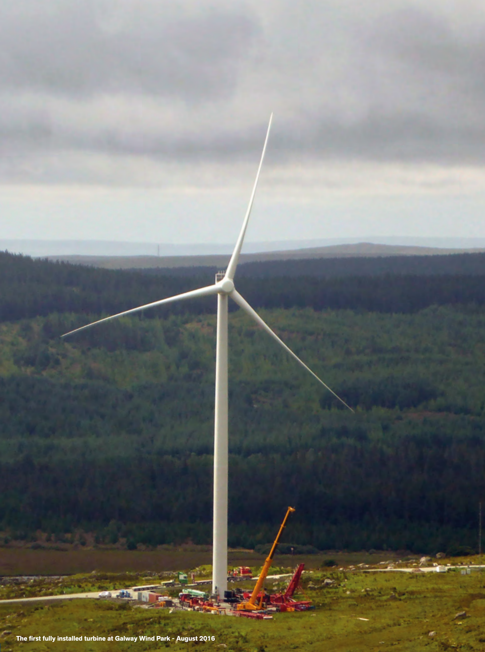
The first fully installed turbine at Galway Wind Park - August 2016