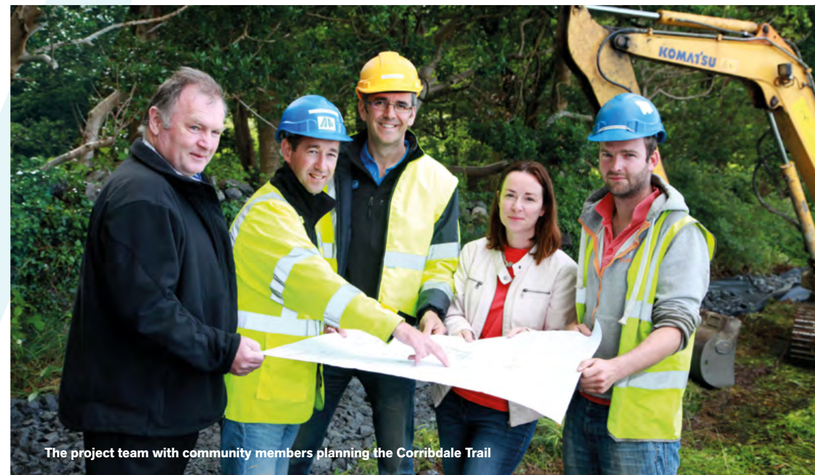
The project team with community members planning the Corribdale Trail

The analysis was undertaken by the Galway Wind Park team. Feedback and comments are welcomed to sustainability.ireland@sse.com . For more information about Galway Wind Park, please see the project website which features key updates: www.sse.com/galwaywindpark .