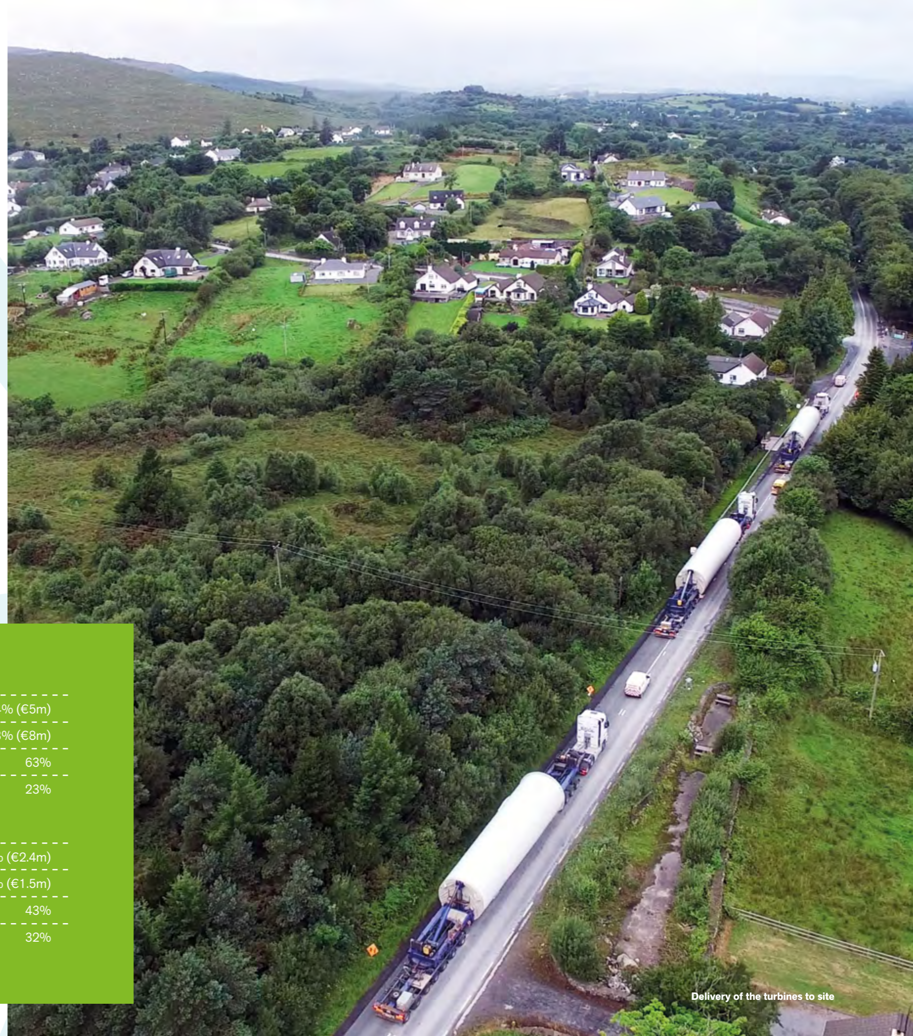
Delivery of the turbines to site

*Data provided by Roadbridge as at August 2016 ** Data provided by Suir Engineering as at August 2016