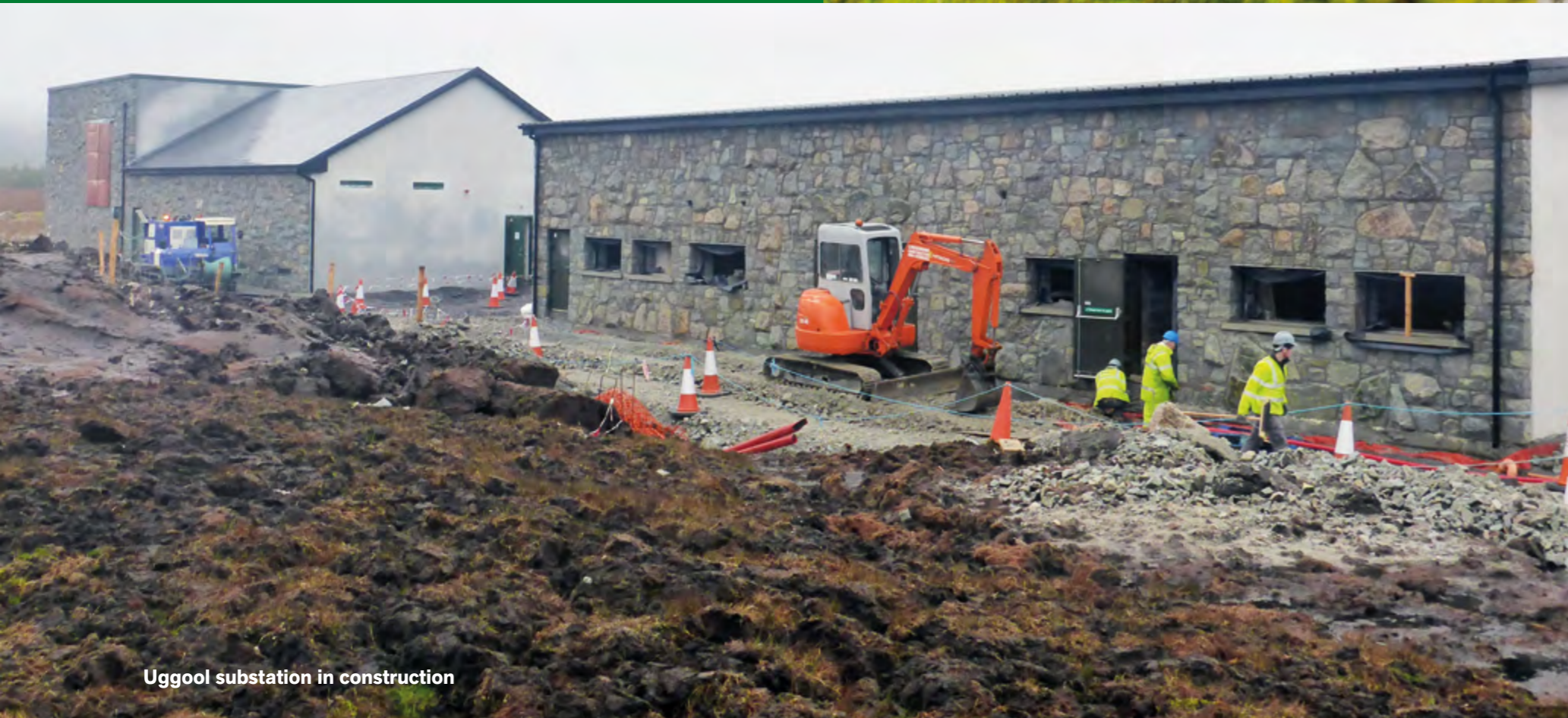
Uggool substation in construction