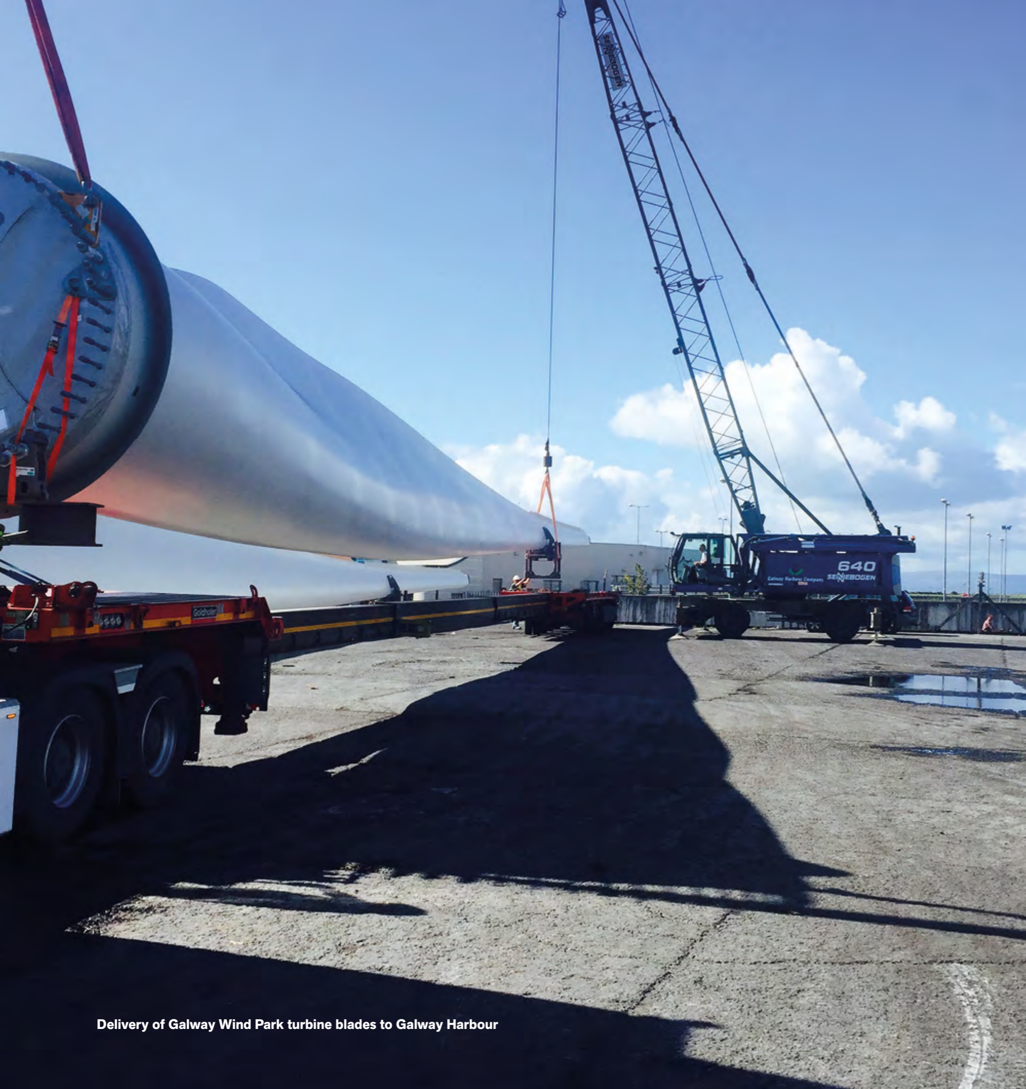
Delivery of Galway Wind Park turbine blades to Galway Harbour

In conversation with: Captain Bob Ellis Deputy Harbour Master